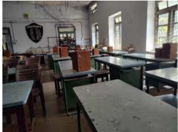
SOXHLET EXTRACTION MANTLE