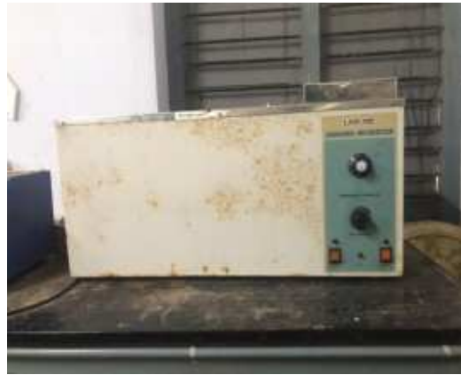
SINGLE DISTILLATION UNIT