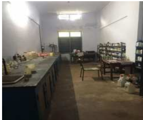
M. Sc. & B. Sc. LABORATORY