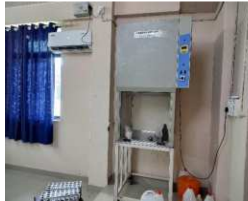
TISSUE CULTURE RACK